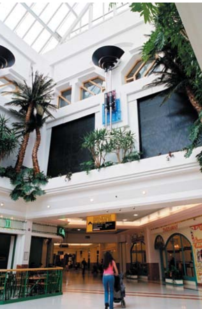
▲ Merryhill Shopping Centre West Midlands Installation of a 54 zone networked public address/voice alarm system

With over 30 years' experience in the design, installation, commissioning and maintenance of fire detection, voice alarm and public address systems, we are one of the few UK companies truly qualified to meet the complex requirements of today's multi-purpose sites.