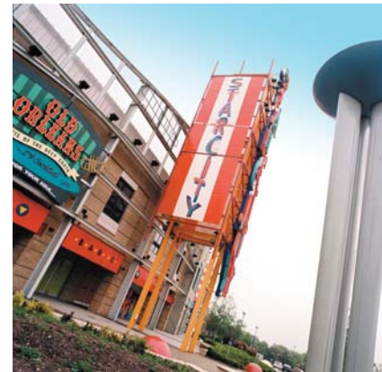
▲ Star City Entertainment Complex Birmingham Installation of a multi-zone public address and voice alarm system, fire telephones and induction loops for the hard of hearing

Testament to this is our loyal and expanding base of private and public sector clients for whom we have completed a host of prestigious installation, commissioning and maintenance projects – on time and within budget.