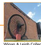
Wigan & Leigh College